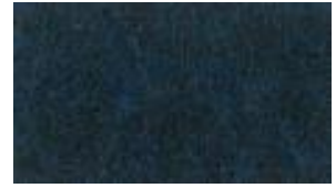
A4 - DARK BLUE