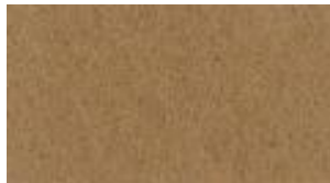
A10 - CREAM