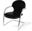
UC-123 Black Leather Arm Chair 550 x 550 x 870 mm.