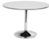
UT-114A White round Table Dia 750 x 750 mm.