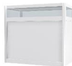
PXS-001 Table Showcase 500 x 1000 x 1000 mm.