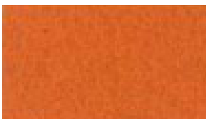
AS1 - ORANGE