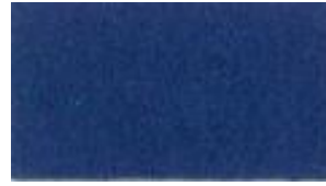
A3 - BLUE