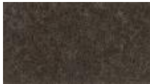
A14 - BROWN