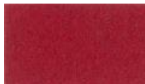
AS7 - Rose