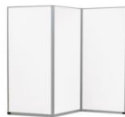
PA-009 White Partition 1000 x 2400 mm.