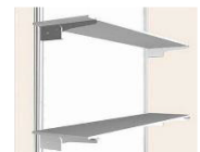
PA-002 Flat Shelf 300 x 950 mm.