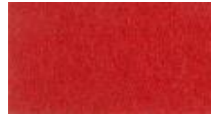
A8 - RED