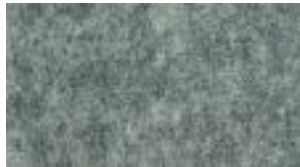
A6 - GREY