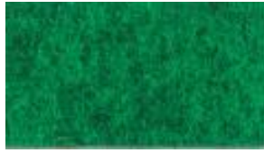
A2 - DARK GREEN