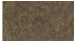
A11 - BEIGE