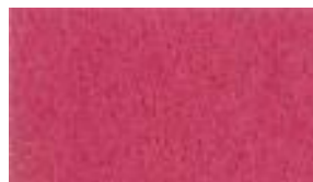
AS3 - PINK