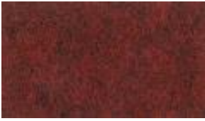
A1 - DARK RED