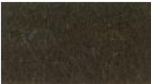
A13 - CHOCOLATE