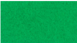
A9 - GREEN