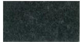
A12 - BLACK & WHITE