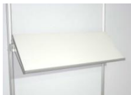
PA-003 Slope Shelf 300 x 950 mm.