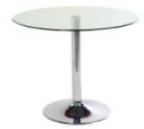
UT-160 Glass Round Table Dia 650 x 750 mm.