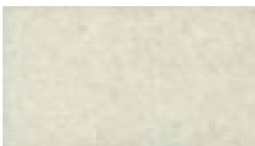
AS6 - WHITE