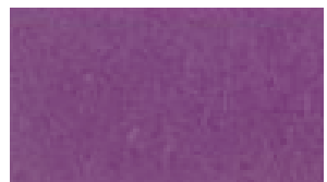
AS4 - PURPLE