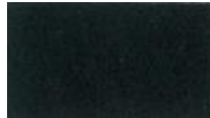
A7 - BLACK